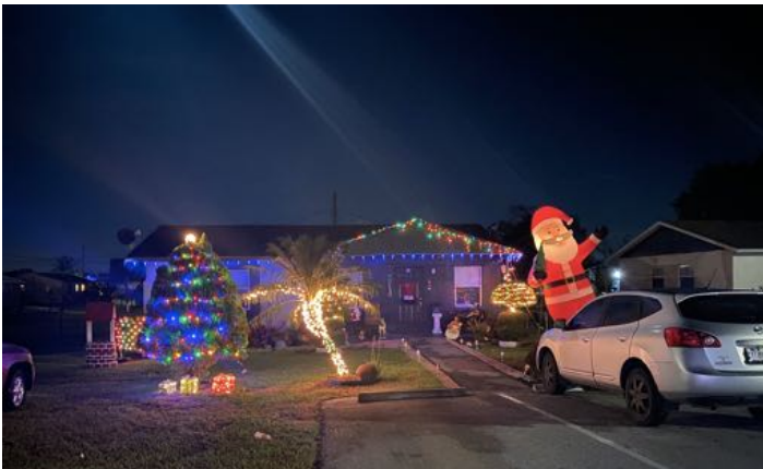
Okeechobee center 3 rd place winner