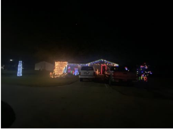
Okeechobee center 1 st place winner