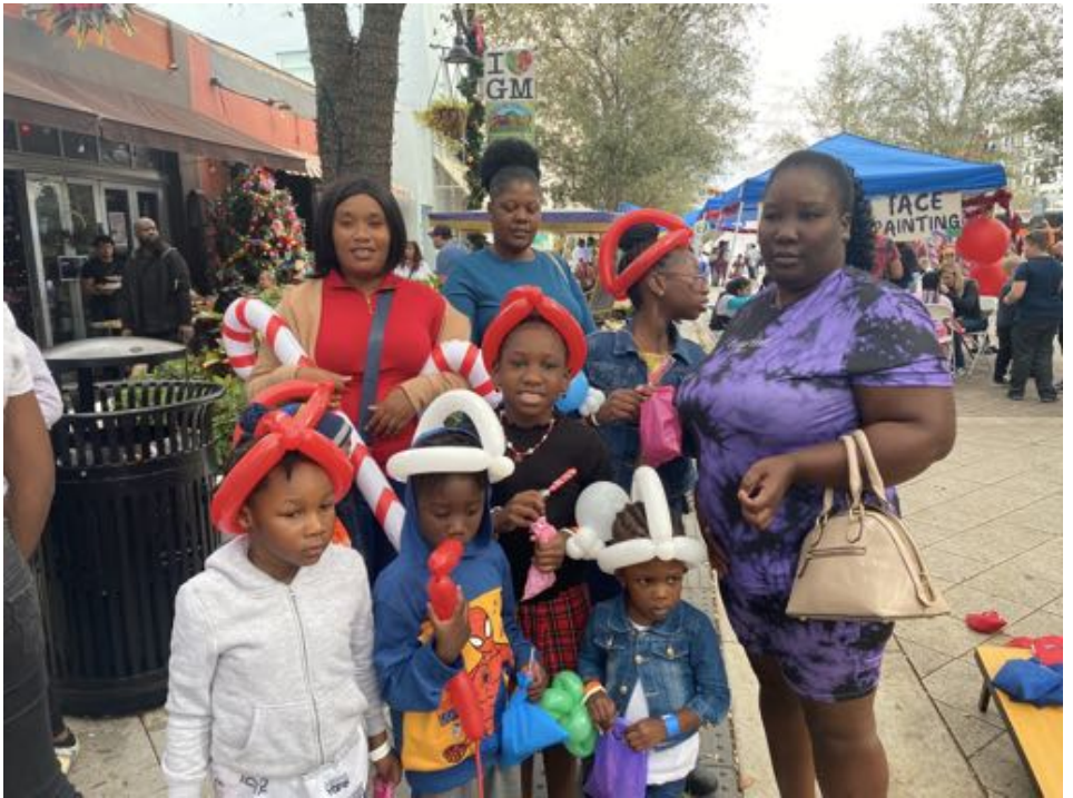
Our residents had an awesome time at the 5 th Annual Youth Christmas Celebration on December 23 rd .