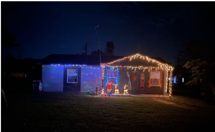
Osceola Center 2nd place winner