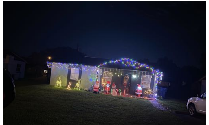
Osceola center 1 st place winner