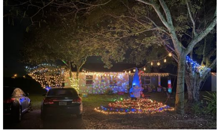
Okeechobee Center 2nd place winner